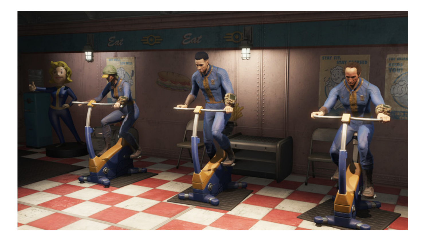
Fallout 4 Vault-Tec Workshop Download Link Pc

Download ->>> <a href="http://bit.ly/2NWEu1B">http://bit.ly/2NWEu1B</a>